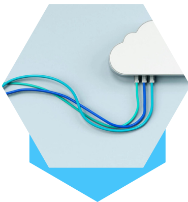
Business Continuity Management System (BCMS)

As business consultants, we have developed, tested, and implemented national and international standards across diverse and complex industries to address regional and global threats, including the recent COVID-19 pandemic. Our frontline engagement includes constructing organization-wide response plans, business disruption plans, emergency response plans, business continuity plans, comprehensive training programs, and partial and full-scale exercises to assess the plans' effectiveness.