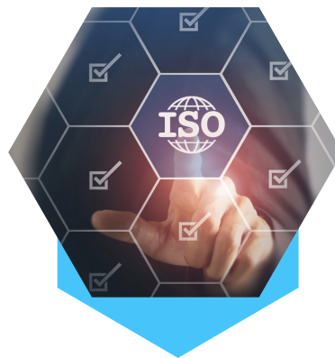
ISO Management System Standards